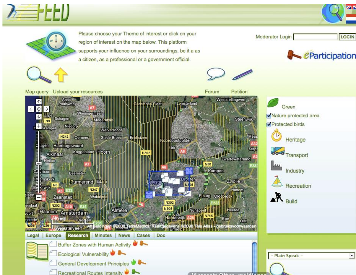
Figure 4: Interface of the platform for the Flevoland pilot

The interface of the platform instance developed for this Flevoland pilot is shown in Figure 4. It is linked to the Oracle database of the regional authority of Flevoland; all map layers available can be projected on this Google map screen. In this way the conflict resolution system will maintain dynamic input from legal constraints and map layer updates.