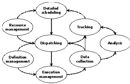
Figure 1 Generic model of the functional modules of a MES

In contrast to ERP-systems MES were originally developed for supporting shop floor processes. Thus the shown fundamental gaps of ERP-systems to the requirements do not exist or at least not to that extent. MES needs to be tightly adapted to the regarded production process. This is mostly done by customizing or adapting the software and modelling shop floor processes. The amount of software adaptations needed is significantly lower than those for an ERP-based solution, simply because there are no fundamental gaps to be solved.